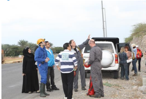
First cave expedition-2011

The first scientific expedition for Emirates Geographical Society was to the northern emirates to discover caves. This was the first expedition of its kind. A team from "Slovenia", one of the world's leading countries in cave exploration, including one their most experienced scientists in unknown cave analysis, participated.