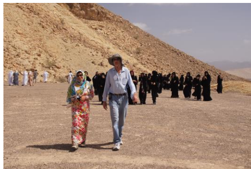
Field trip with Scintiest from NASA-2011