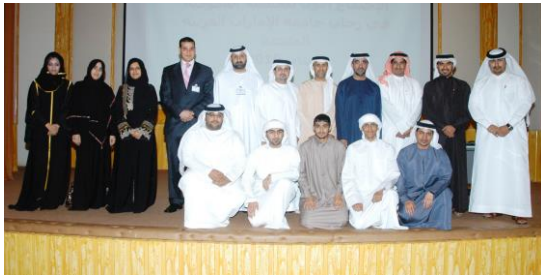
First Inaugural Board of Directors-2010

The Emirates Geographical Society is a scientific and professional society concerned with the discipline of Geography. It was founded by a group of Emirati geographical scientists, together with a number of geography learners and professionals, as well as others with an interest and commitment to geography. The society was officially convened in October 2009, by the Ministry of Social Affairs, and is based in Abu Dhabi.