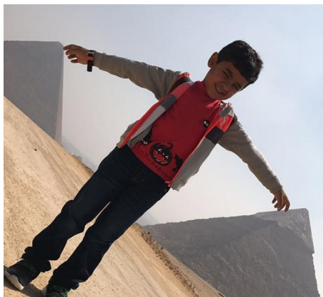
Egypt trip 2017

The Program's objective is to establish a structure and framework for voluntary work for university students, in particular to encourage outstanding students to become ambassadors to schools and universities to promote for the science of geography.