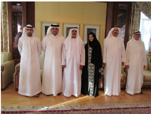
With shick Nahian bin Mubarak

The Emirates Geographical Society vision is to contribute in the development not only of the nation and the region, but also the world, through the voluntary provision of expertise, skills and experience. We follow a global rather than a local focus on human culture and its environment, and look forward to taking an active role in deepening the knowledge and professionalism in all areas of geography.